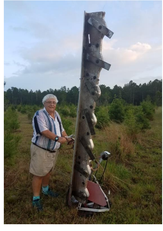
Article on the next page about this unique trimmer