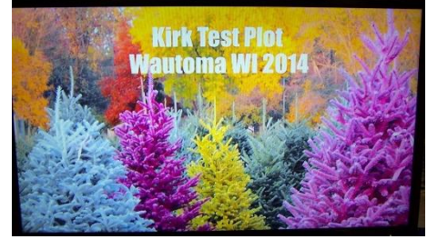
They offer Kolors in Gold, Lt. Blue, Lt. Pink, Red, Black, Bright Pink, Dark Blue, Purple, White, Turquoise and more!