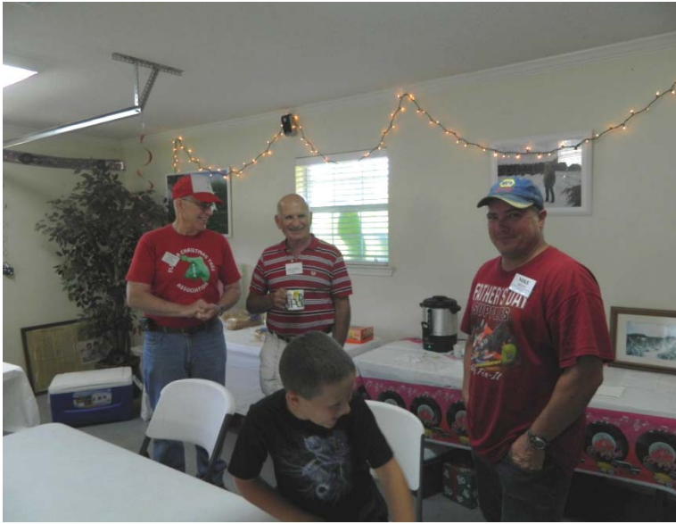
Sharing information and fellowship