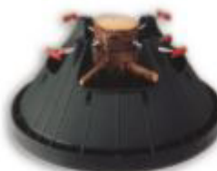
Stands – Cinco, Yule Tree, Gunnard and More