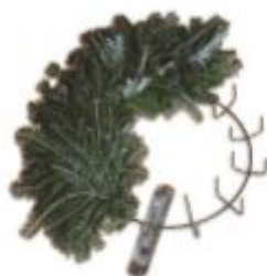
Clamp-Type Wreath Frames & Machines