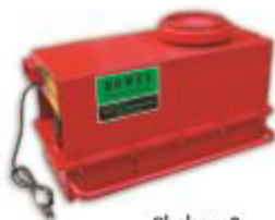
Shakers & Other Equipment